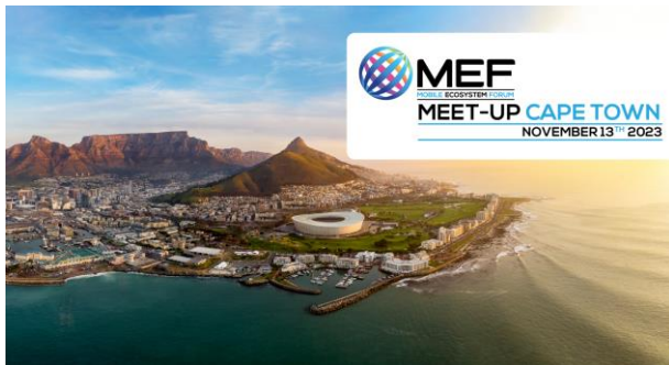
13th Nov - MEF Meet-up Africa