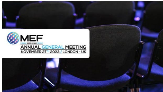
27th Nov - MEF Annual General Meeting