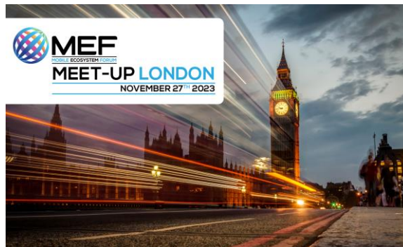
27th Nov - MEF Meet-up London