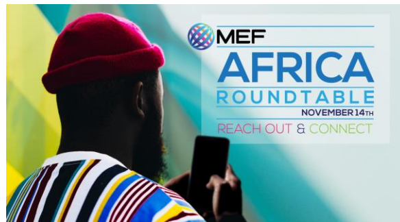
14th Nov - MEF Roundtable Africa