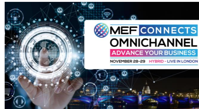
28-29th Nov MEF CONNECTS Omnichannel